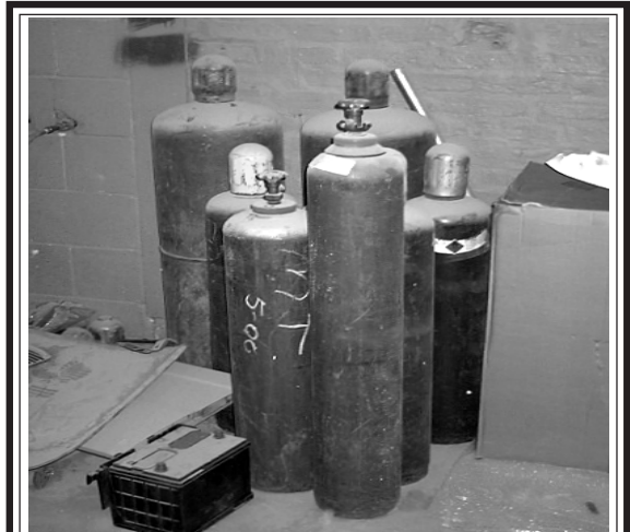
These cylinders need to be secured, and the oxygen cylinders separated from the flammable gas cylinders!